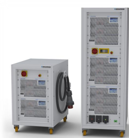
Figure 4: REGATRON's rack-integrated turn-key system solutions, e.g., 72 kW (left) and 162 kW (right) power levels. Various types of AC/DC connectors and cables allow for comfortable handling. Third-party product integration and numerous safety options are additional features.