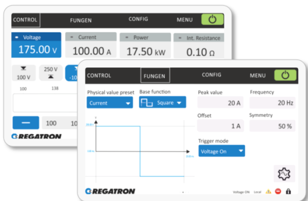
Figure 3: Intuitive control by HMI touch display. Everything you need at a glance.

The HMI built into the front panel allows comprehensive and convenient operation of the DC electronic load via touch display.