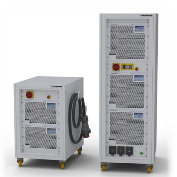
Figure 4: REGATRON's rack-integrated turn-key system solutions, e.g., 72 kW (left) and 162 kW (right) power levels. Various types of AC/DC connectors and cables allow for comfortable handling. Third-party product integration and numerous safety options are additional features.